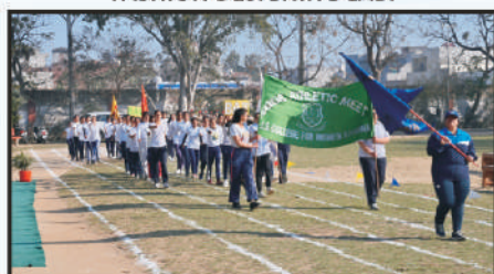
COLLEGE SPORTS GROUND