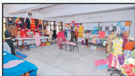
FASHION DESIGNING LAB.