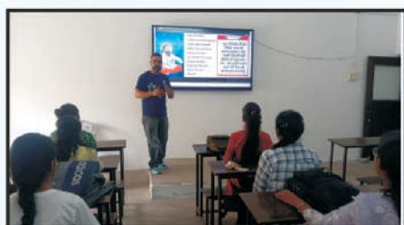
COLLEGE SMART CLASS ROOM