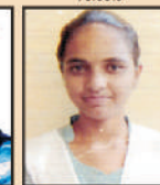
Kumkum B.A. 6th Sem 74.04%